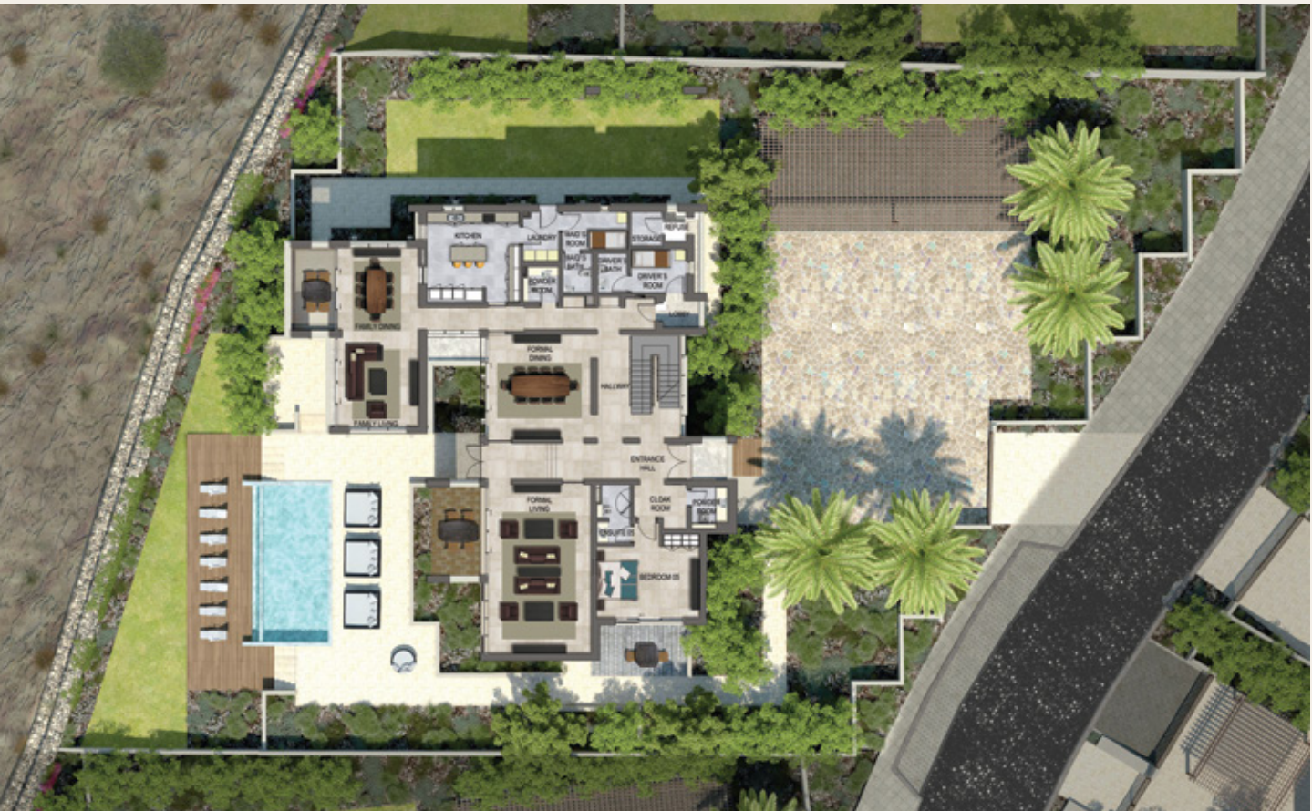
All floor plans and images are for illustrative purposes only. Total Area represents the Gross Built Up area, measured to the outside wall (or the central point for shared party wall) and includes covered terraces and uncovered balconies.