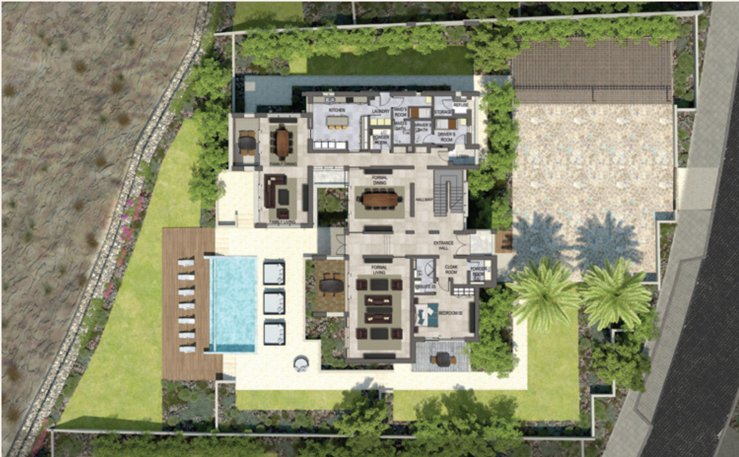
All floor plans and images are for illustrative purposes only. Total Area represents the Gross Built Up area, measured to the outside wall (or the central point for shared party wall) and includes covered terraces and uncovered balconies.