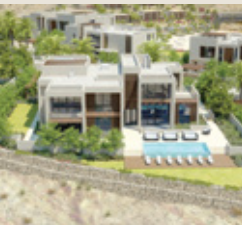
جميع الصور والمخططات هي لأغراض توضيحية فقط. تمثل المساحة الكاملة إجمالي المنطقة الكاملة بالقياس مع الحائط الخارجي (أو النقطة المركزية للحائط المشترك) وتضم التراسات المغطاة والشرفات الغير مكنسوفة.