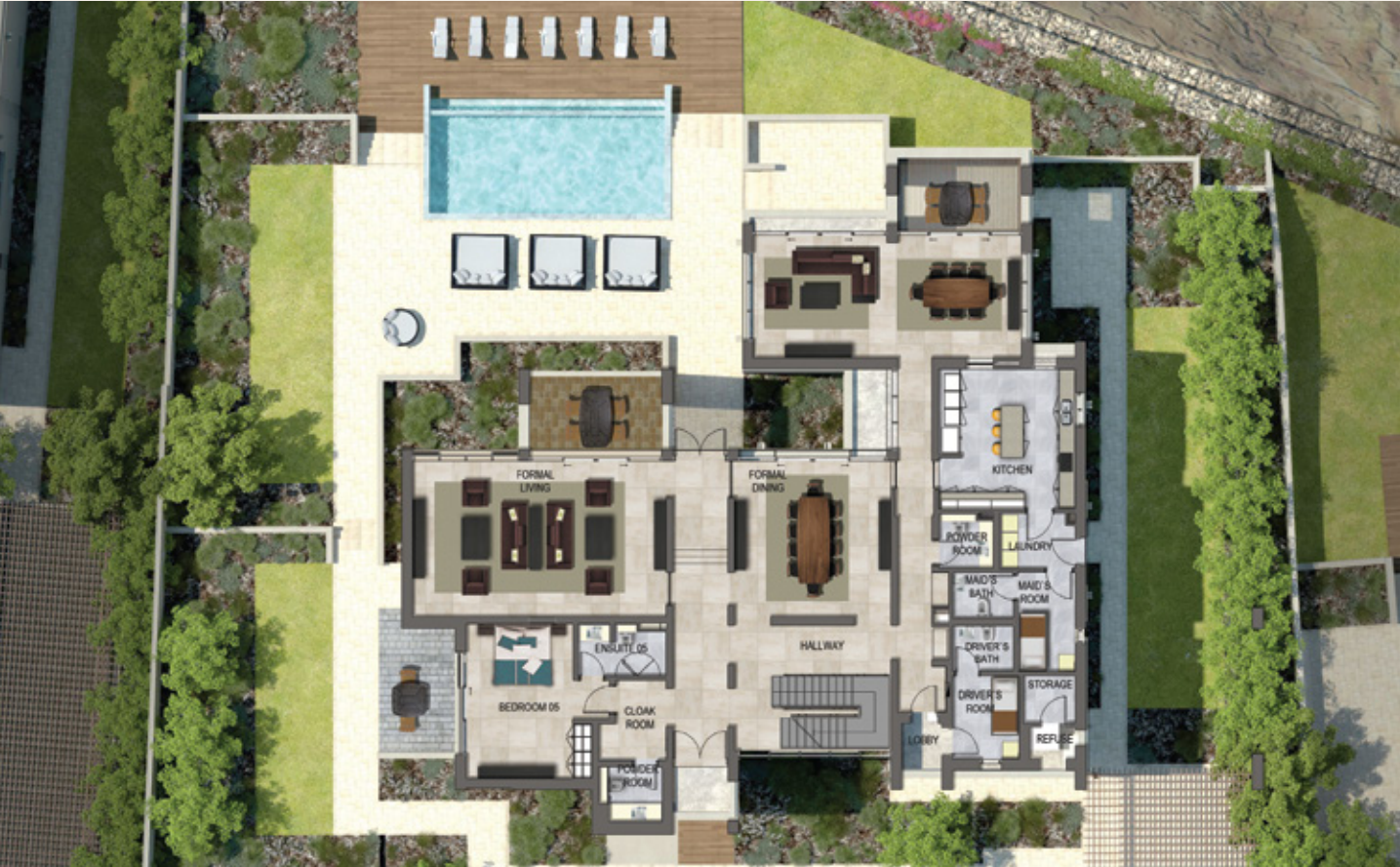
All floor plans and images are for illustrative purposes only. Total Area represents the Gross Built Up area, measured to the outside wall (or the central point for shared party wall) and includes covered terraces and uncovered balconies.